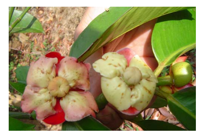
Fig. 1 Variation of sepal color of mangosteen, obtained from population in Wanayasa, West Java.

Compiled, with permission from Anggraeni 2003.