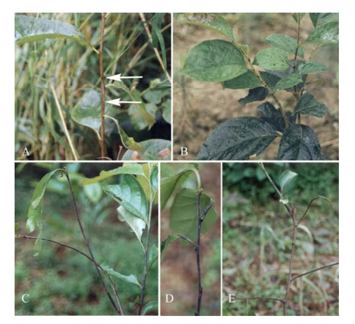
Fig. 2 Symptoms of persimmon anthracnose causing by Colletotri chum gloeosporioides on 'wild persimmons' and 'Wuheshi'. (A) Lesions (arrows) on wild persimmons in the shrubby hillsides. (B) Lesions on twigs a persimmon seedling in the nursery. The twigs developed from the scions of 'Wuheshi' that were grafted onto the rootstocks of 'wild persimmons'. (C-E) Symptoms of anthracnose on one-year-old persimmon plants transplanted to field. (C) Symptoms of diseased twigs. Note that twigs infected became dark brown and leaves almost completely shed off on two twigs; but the petioles were not infected on another a twig. (D) Lesions on a twig developing to petiole. (E) Symptoms of twig blight.

The investigation indicated that the initial inocula came from the rootstocks carrying the pathogen. Due to the limitation of root sucker propagation at a large scale, growers had to choose another means of propagation. Alternatively, clonal stocks were reproduced by whip grafts and the close relative, wild persimmon, was used as the rootstock. This was because wild persimmons grow widely in shrubby hillsides, and are an available, rich genetic resource. In addition, this rootstock significantly contributed to adversityresistance and survives. However, the wild persimmon in shrubby hillsides is susceptible to anthracnose disease but