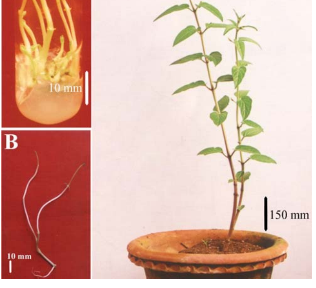
Fig. 2 Ceropegia maccannii Hook. (A) Axillary bud proliferation on MS medium containing 7.5 \mu M BA. (B) Rooted shoot grown on \frac{1}{2} MS + 0.5 \mu M IBA + 5% sucrose. (C) Transplanted flowered plantlet.