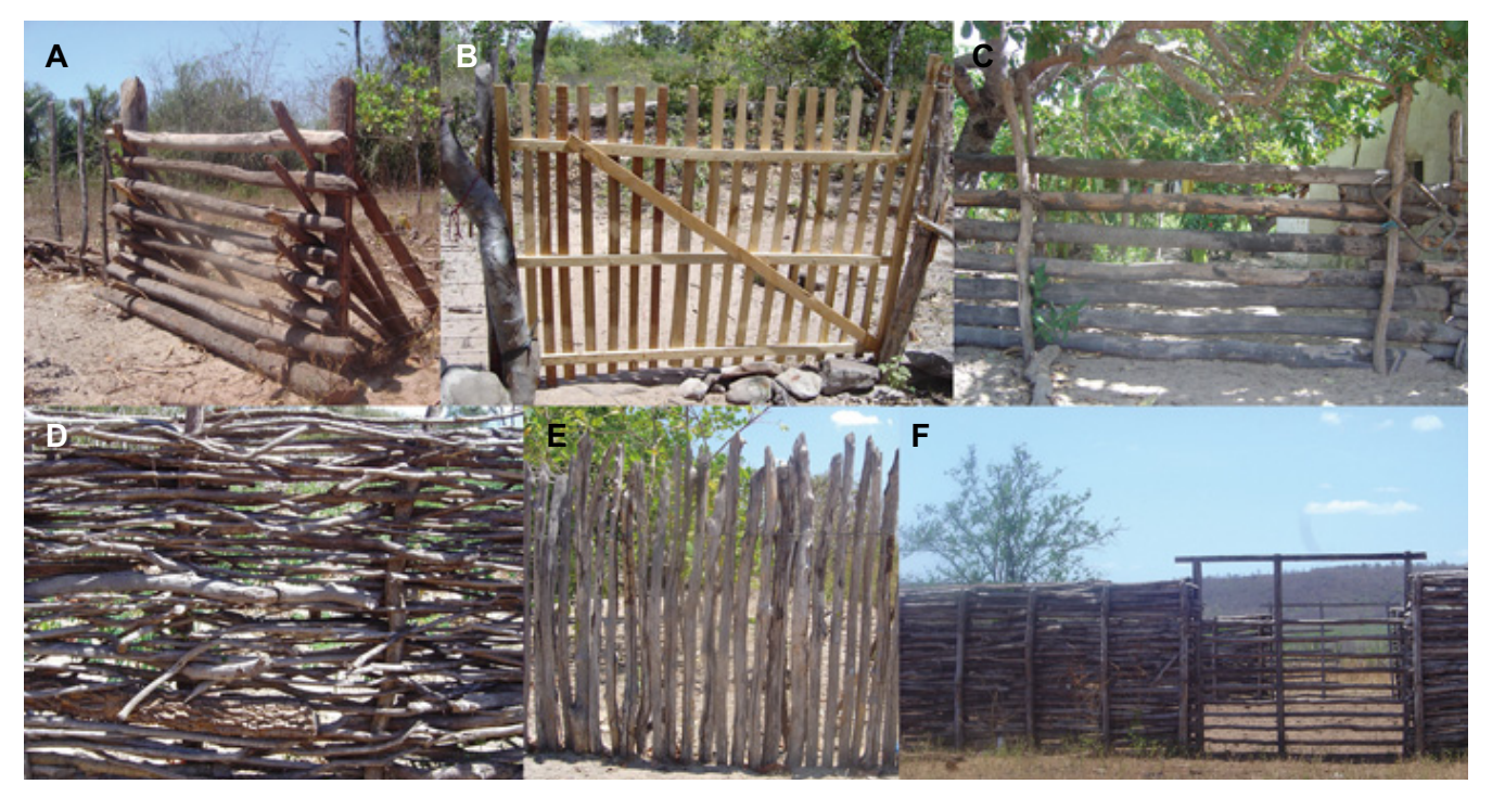
Fig. 2 Fences and gates used by the population of Cocal County, Piauí, Brazil. (A) Porteira , (B) gate, (C) passageway fence (fence of passagem ), (D) fence of cama , (E) fence of fachina , (F) barbed wire fence.

only to be tallied on the list of extractive resources of the Northeast. Lorenzi and Matos (2003) wrote about H. courbaril and S. lutea in a most reverent manner, exhalting the importance that these species possess in the diet of rural populations of this region.