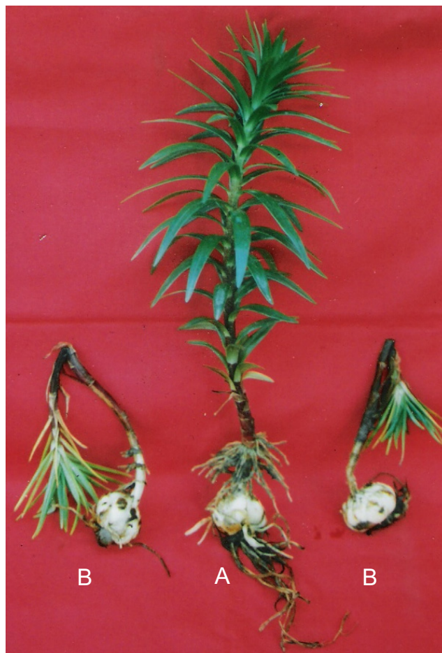
Fig. 2 One-year old bulbs of Lilium . (A) Selected and (B) control plants, 30 days after inoculation with sporangia suspension of P. cactorum (bar = 0.5 cm).

problems and perspectives. Acta Horticulturae 216 , 45-52