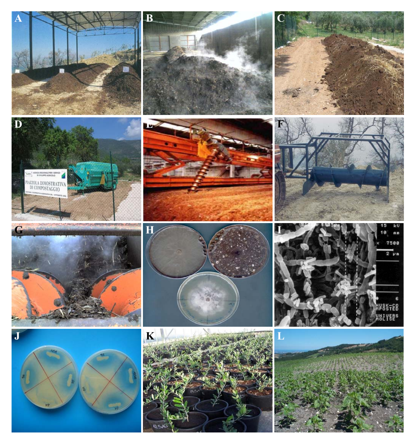
Fig. 2 Images of composting processes carried out in the last decade. (A) Composting process carried out on 2-POH in pilot scale plant. (B) 2-POH composting carried out in confined pilot scale plant. (C) Composting of 3-POH carried out in open air pilot scal plant. (D) Composting pilot plant and turning/grinding machine. (E) OH composting carried out in industrial scale plant. (F) Prototype of the turning machine realized. (G) Olive mill and agricultural residues turning and grinding. (H) In vitro suppressive test on Verticillium dahliae . (I) SEM observation (7500 x) of a sample of composted OH. (J) In vitro activity of antagonistic bacteria isolated from compost. (K) In vivo suppressive trials carried out in a nursery on young olive plants. (L) Agronomical trials carried out in open field on sunflower.

factor of disease suppressive effect in greater detail (Fig. 21). Several specific microbial strains with notable suppressive activity were selected and tested in vitro and in vivo against several soil-borne, fungal plant pathogens (Fig. 2J). Suppressive composted olive waste was also tested in a nursery against Verticillium spp. olive tree wilt (Fig. 2K) (Alfano et al. 2004; Lima et al. 2008a). Furthermore, composted olive waste proved to have negligible agricultural value when used as soil conditioner, amender and fertilizer (Fig. 2L).