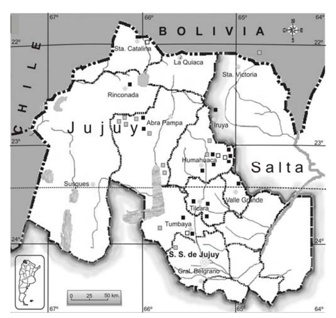
Fig. 3 Distribution of genotypes of 'Collareja' in the provinces of Jujuy and Salta.

Sukhotu et al. (2005), considered that the present genetic diversity in Andigena was modified and attenuated through sexual polyploidization and intervarietal and/or introgressive hybridisation after Andigena arose and by long-distance dispersal of seed tubers by humans. In the traditional potato-growing areas of northwestern Argentina, an intense exchange of 'seed tubers' occurs between far-