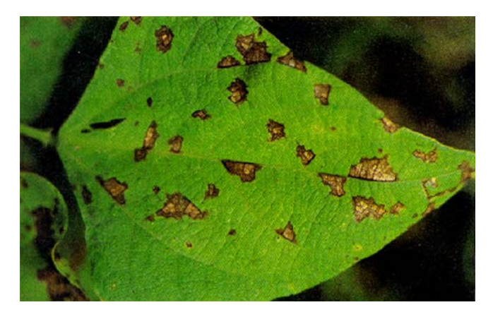
Fig. 6 Common bean leaf showing symptoms of the angular leaf spot disease.

1996; Leister et al. 1996; Yu et al. 1996).