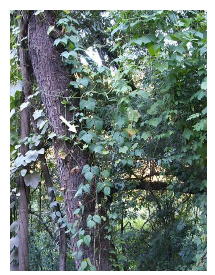
Fig. 2 Typical climbing wild bean plant ( Phaseolus vulgaris var. aborigineus ) growing at the side of the road (arrow) in the Escoipe gorge in the province of Salta, Argentina.

generate fully fertile hybrids (Singh et al. 1995; De Ron et al. 2004). As a result, these resources remained important for the genetic improvement of domesticated types.