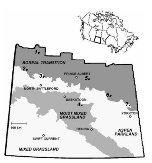
Fig. 1 Location of leafhopper and crop sampling sites in Saskatchewan, Canada, in 2001–2008. (1) Meadow Lake. (2) Turtleford. (3) Medstead. (4) Lanigan. (5) Brooksby. (6) Kelvington. (7) Canora.

AY phytoplasma strains 16SrI-A and 16SrI-B have been found in oats in Europe (Urbanavičienė et al. 2008). AY strain 16SrI-B has been found in barley, bromegrass and wheat in western Canada (Olivier et al. 2009). Aster yellows disease in canola crops in Alberta and Saskatchewan has been reported to be associated with AY phytoplasma strains 16SrI-A and 16SrI-B (Wang and Hiruki 2001; Olivier et al. 2006, 2007).