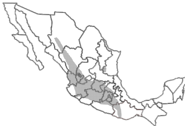
Fig. 1 Distribution of Polianthes in México (adapted from Solano 2000 and Rocha et al. 2006).

Verhoek-Williams (1975) divided the genus Polianthes into two subgenera: Polianthes and Bravoia . These subgenera were separated based on the position of the flowers, colour, size, orientation and position of the lobes of the perianth and insertion of the stamens. Although this proposal has not been published formally (Solano and Ríos-Gómez 2011).